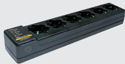
PMLN7102 / PMLN7162