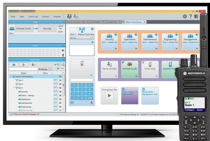
Control Room Solutions

Because enabling rapid response and documenting past incidents can be the key to preventing incidents from becoming tragedies