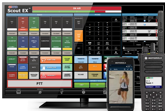
Avtec Scout Dispatch

Connectivity — across devices and networks — is an important part of ensuring you and your entire team are aware and informed at all times.