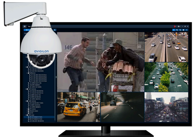
Avigilon Control Center

All of this comes together to provide you with better insights — so you always know what is happening at your site.