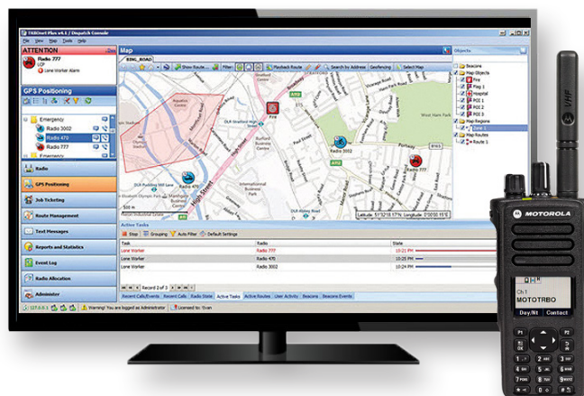
Control Room Solutions

Because enabling rapid response and documenting past incidents can be the key to preventing incidents from becoming tragedies.